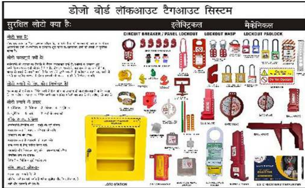
Loto DOJO 2421