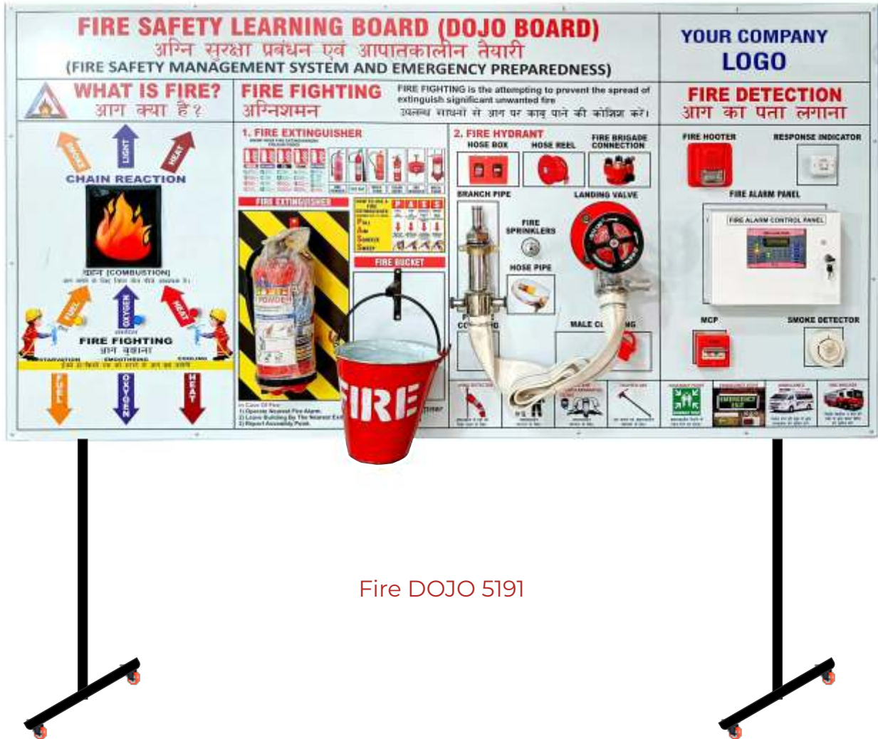
Fire DOJO 5191