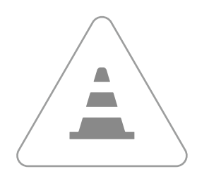
Traffic Safety Products